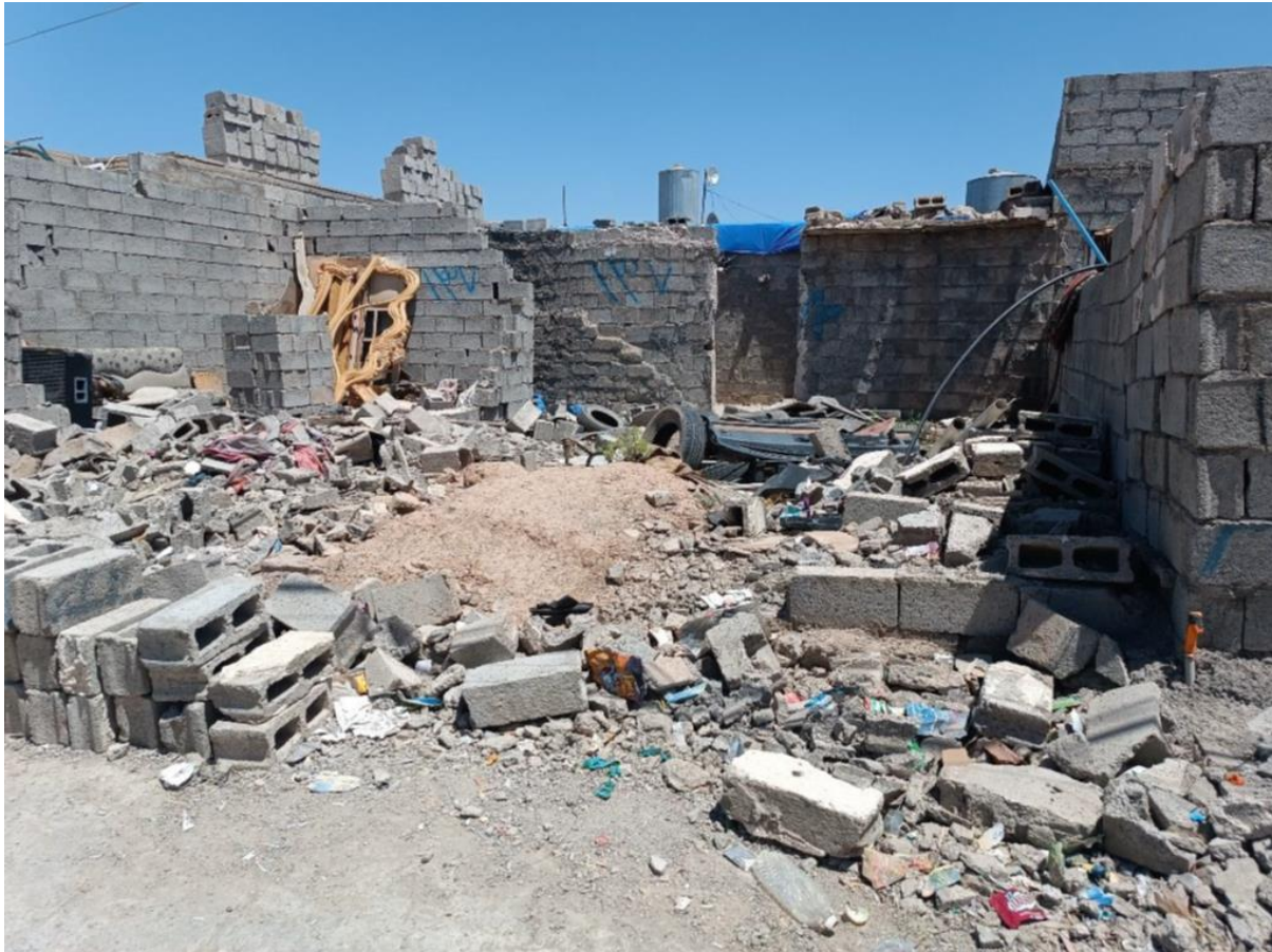
Sharikat Tariq/Hai Al Aska Informal Site Eviction